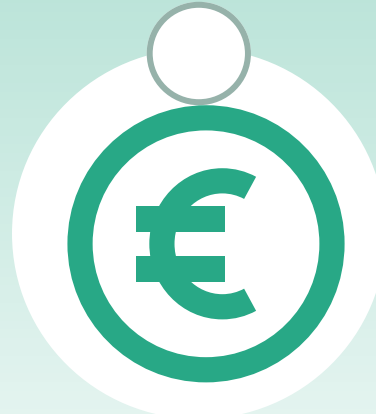
No Banking Fees