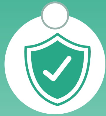
Life Savings Insurance