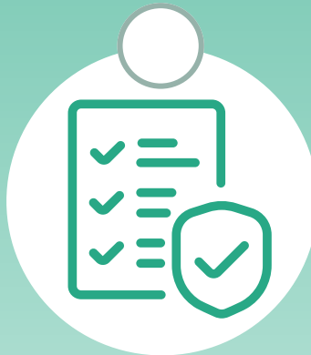
Death Benefit Insurance