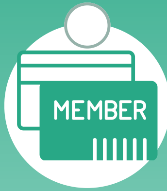
Lough Loyalty Fob